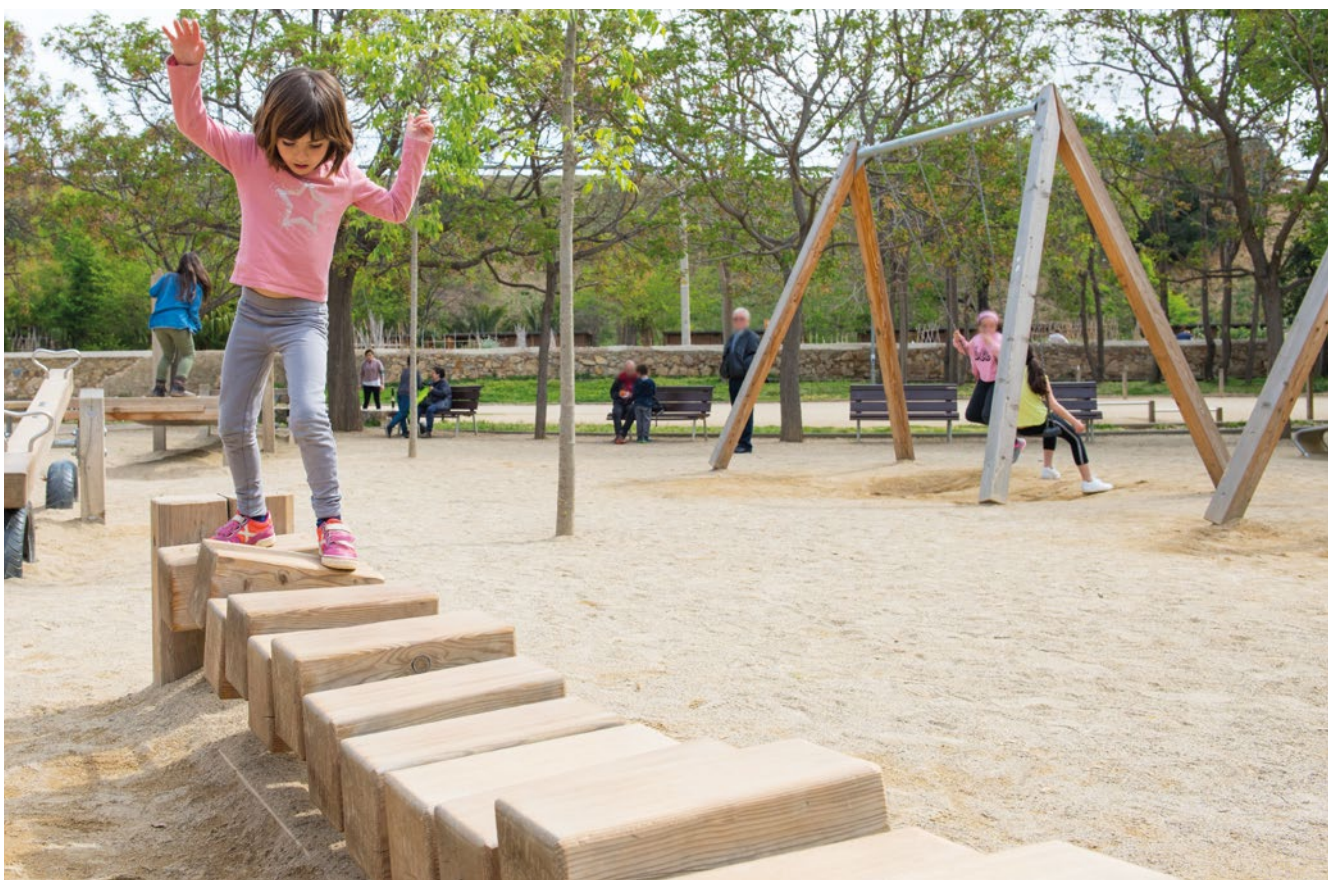
Balance Blocks made of larch with steel feet