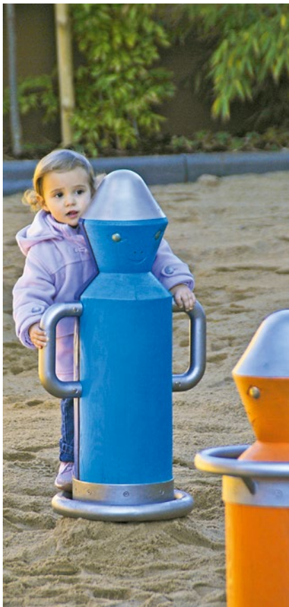
Order No. 6.28100 Whirligig with Arms, light blue / blue