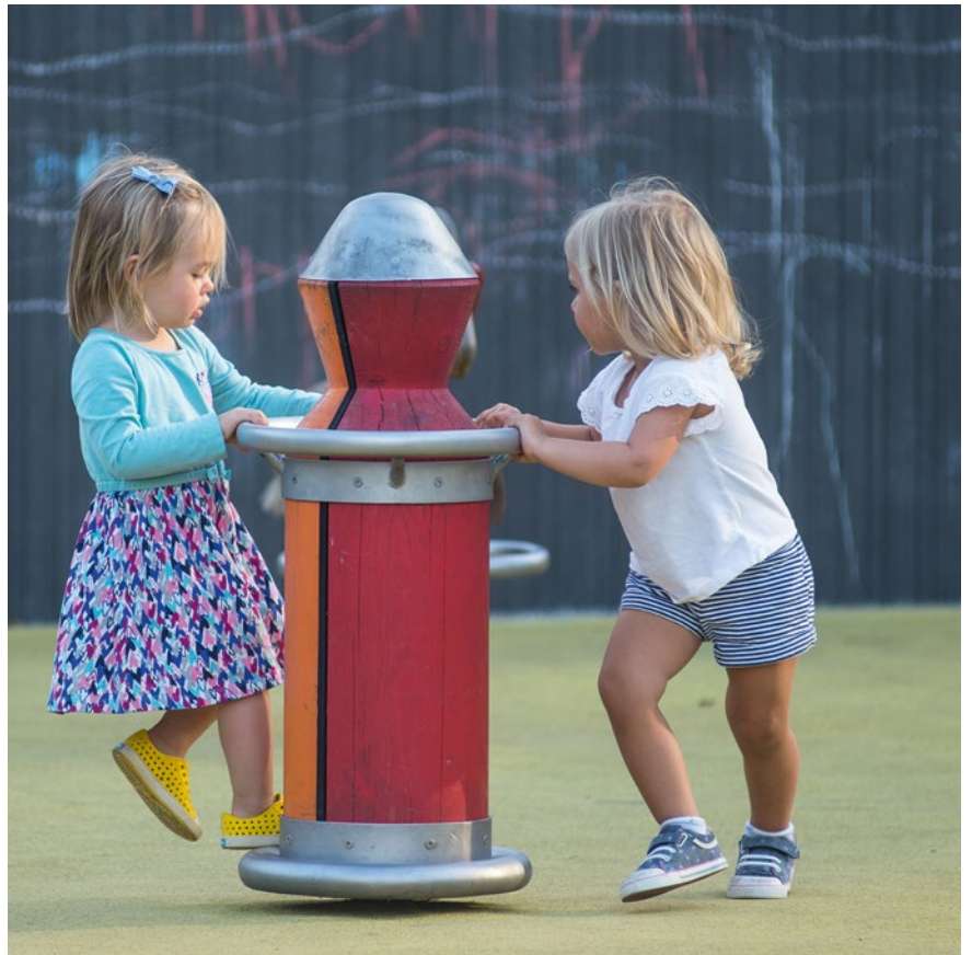
Order No. 6.28104 Whirligig with Collar, red / orange