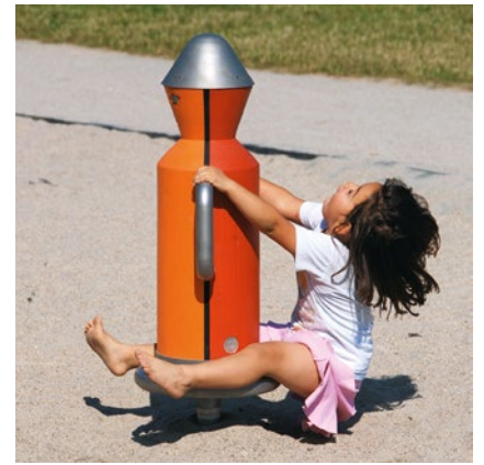
Order No. 6.28100 Whirligig with Arms, red / orange