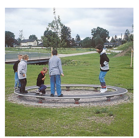
Order No. 6.11800 Springing Circle

The Circular See-saw and the Springing Circle are unusual and well designed seesaw play equipment. Above all if more than two players sit or stand on them. Their special design and the selection of quality materials make them suitable for installation in pedestrian zones, on public places and similar areas in town centres. The Springing Circle can also be used as attractive alternative seating. It is pleasant to sit on the ring rocking slightly and chatting.