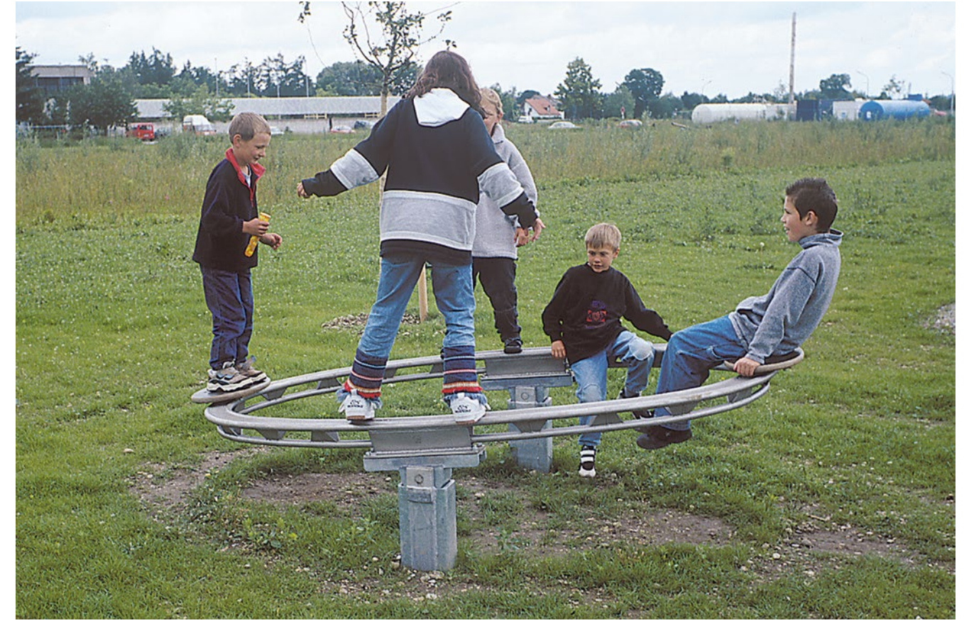
Order No. 6.11900 Circular See-saw