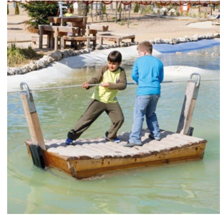
Standard colour of rope red