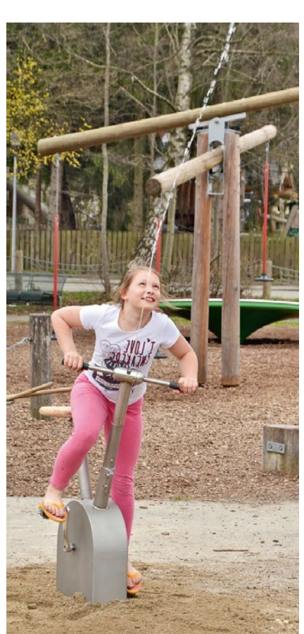
Order No. 5.18130 Pedal Pump with Spray Head in Handlebar