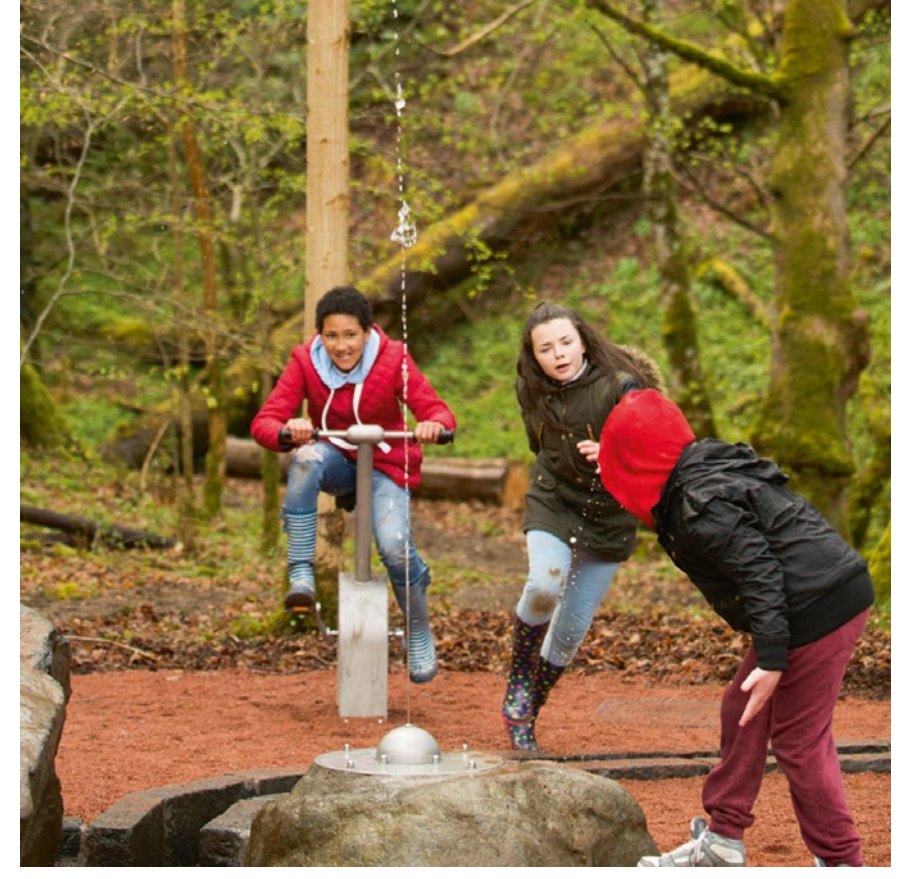
Order No. 5.18230 Pedal Pump for external Spray Head, Photo © Ross Gilmore