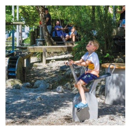
Order No. 5.18130 Pedal Pump with Spray Head in Handlebar