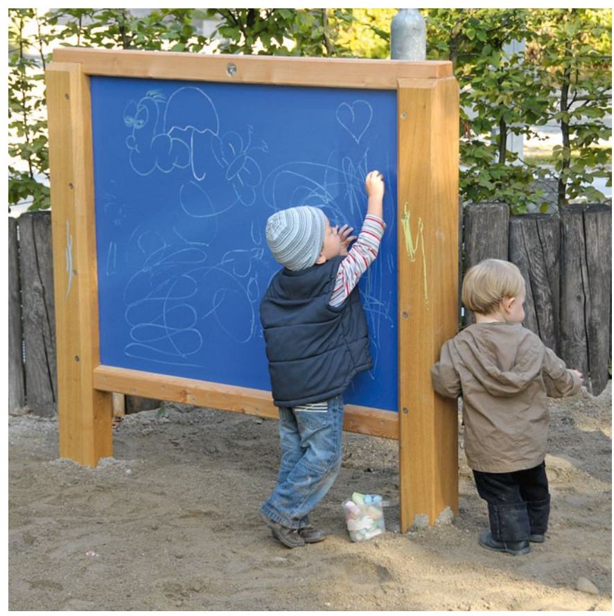
Order No. 4.24455 Drawing Board low version for toddlers (special version without chalk tray)

Drawing Board Drawing Board low version Drawing Board for wall attachment