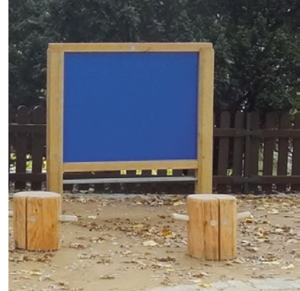
Order No. 4.24450 Drawing Board