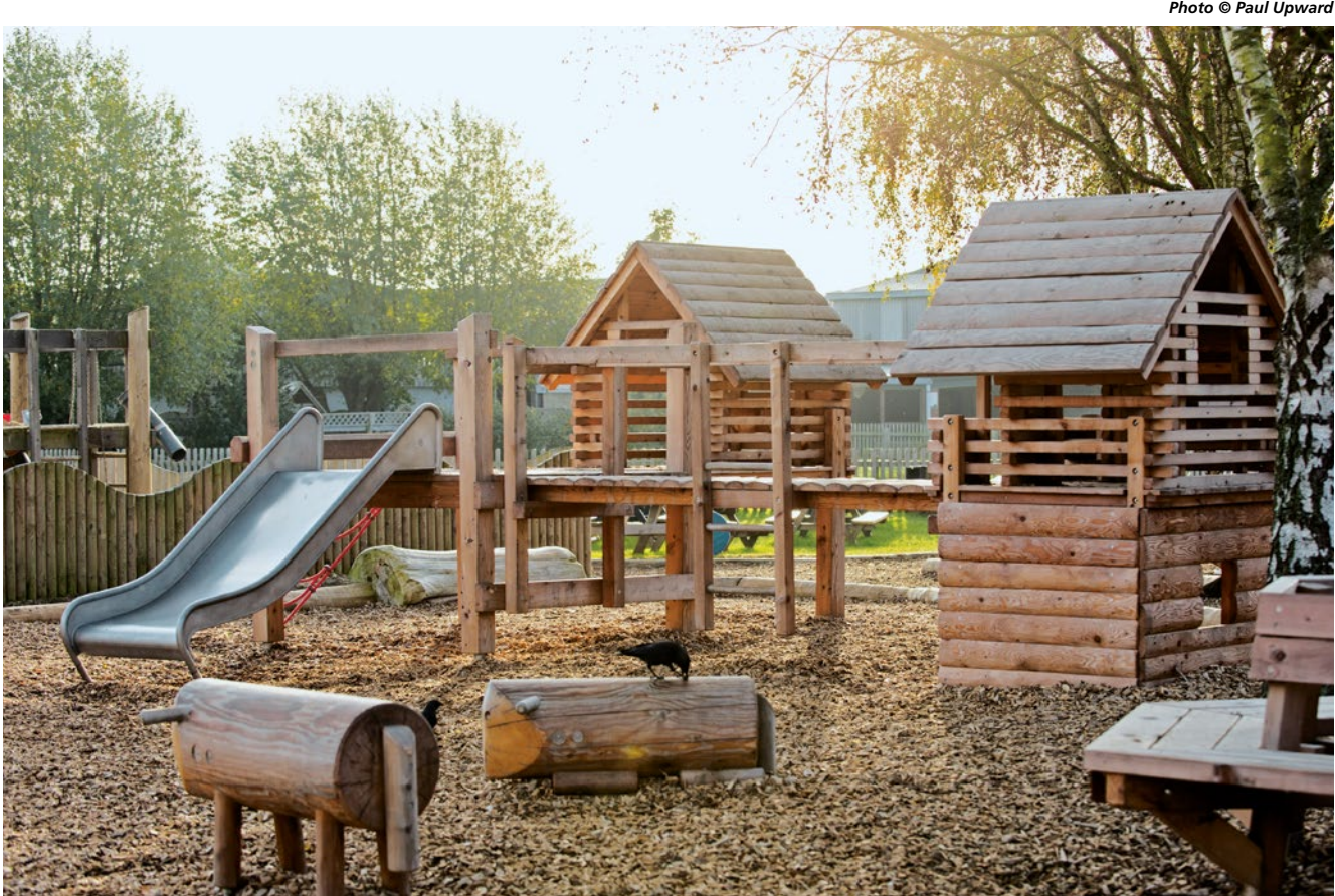
House Group 114