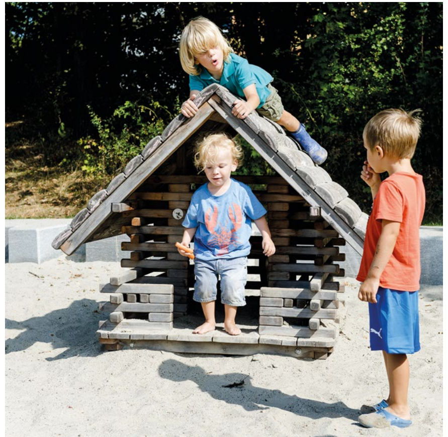
Smallest Playing House