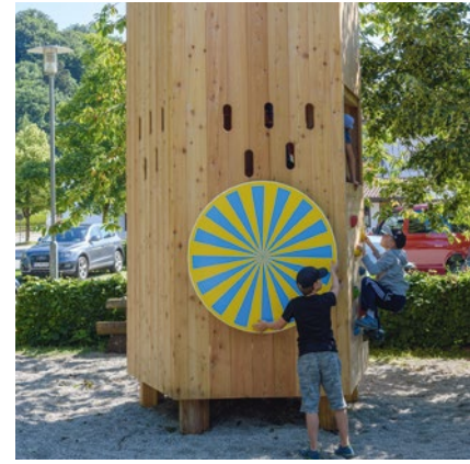
Special version with Rotating Disc 10.22100ff.