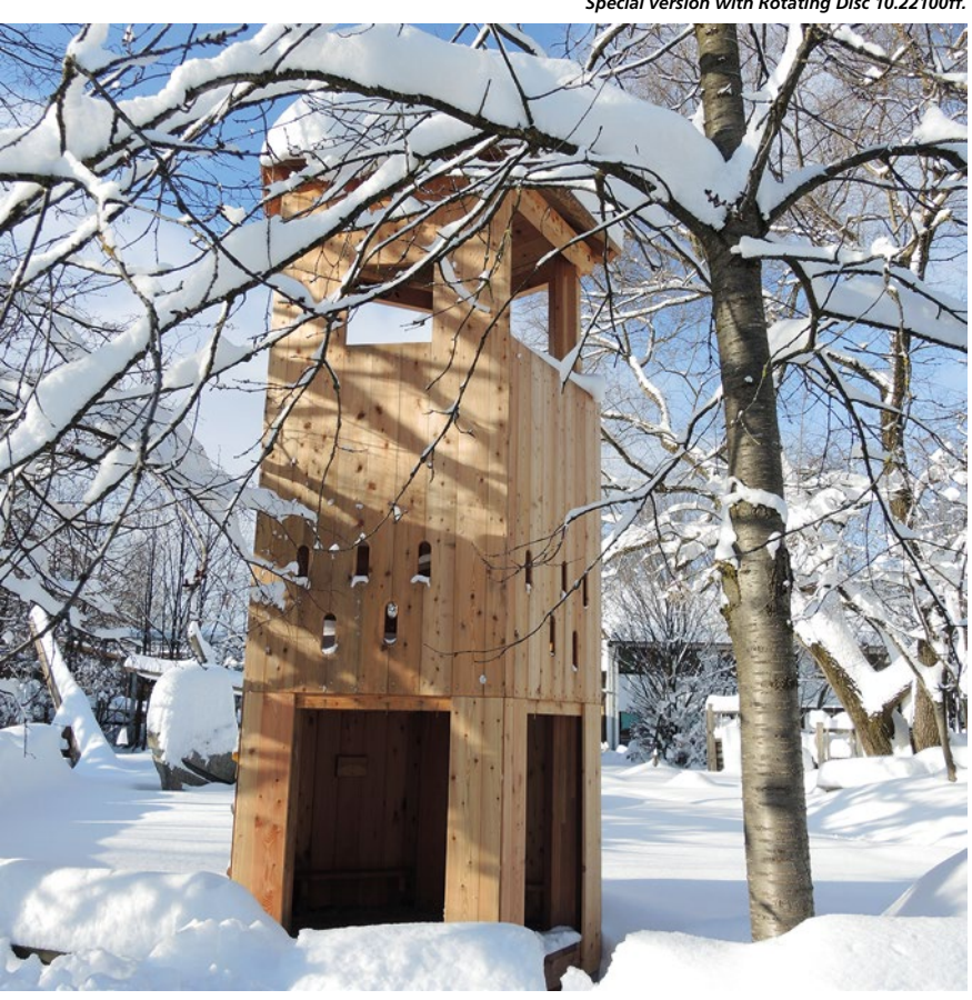
Pentagonal Tower on Stilts